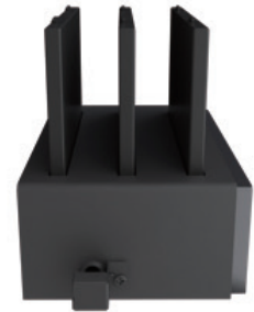
3 Bay Battery Charging Station