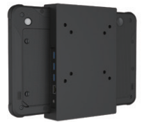
Wall Mount Kit